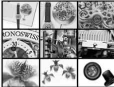
Example of a splitscreen

By pressing the ALL key a split image with all 9 pictures of the memory can be displayed.