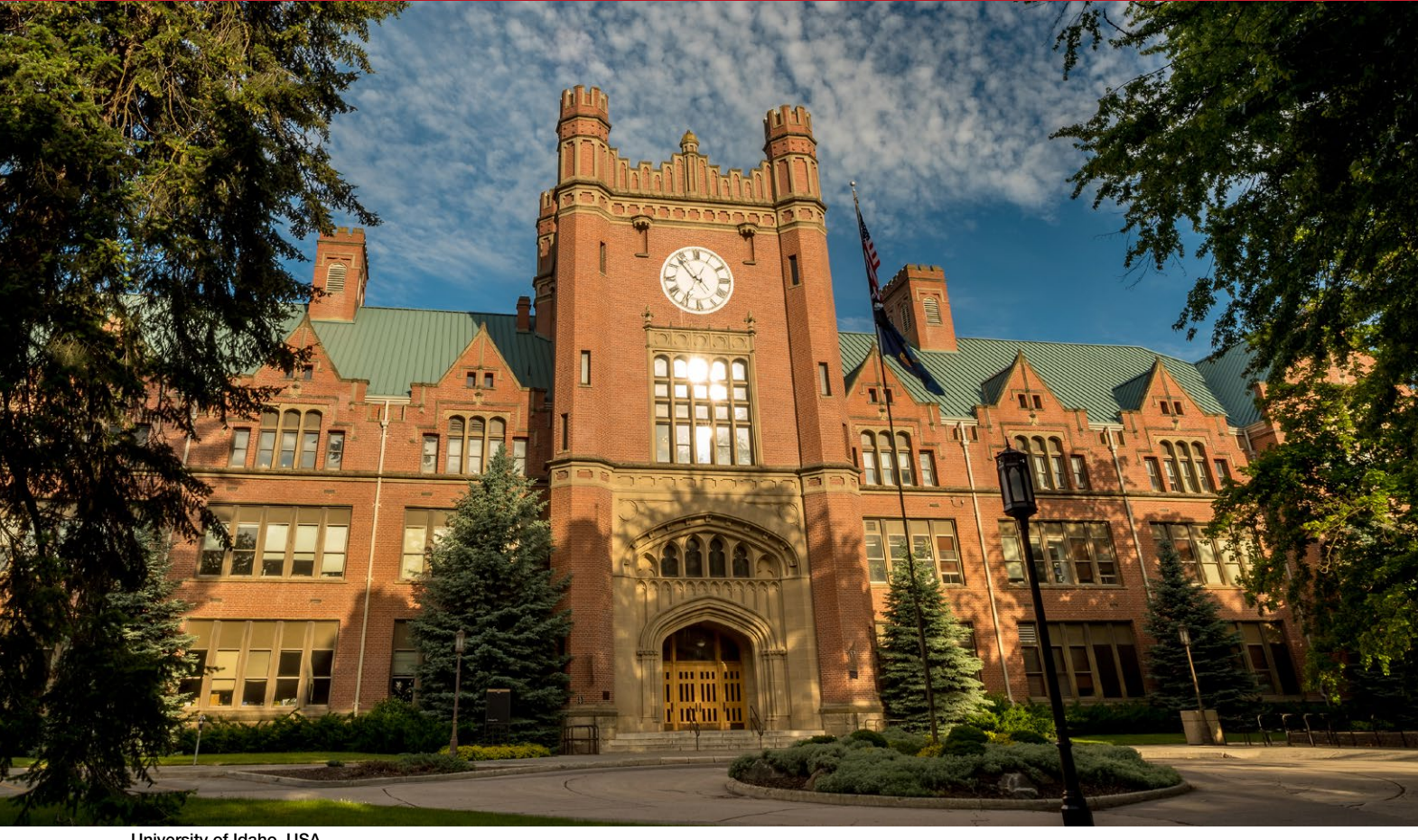
University of Idaho, USA.

eep in the US Northwest, lies the University of Idaho; the state's oldest public university and leader in institutional research. The land grant institution was the first in the nation to offer a doctorate degree in Athletic Training and the world's first genetically cloned equine was crea-