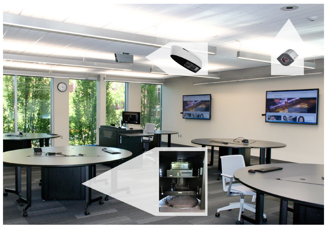
Mert Michael Classroom