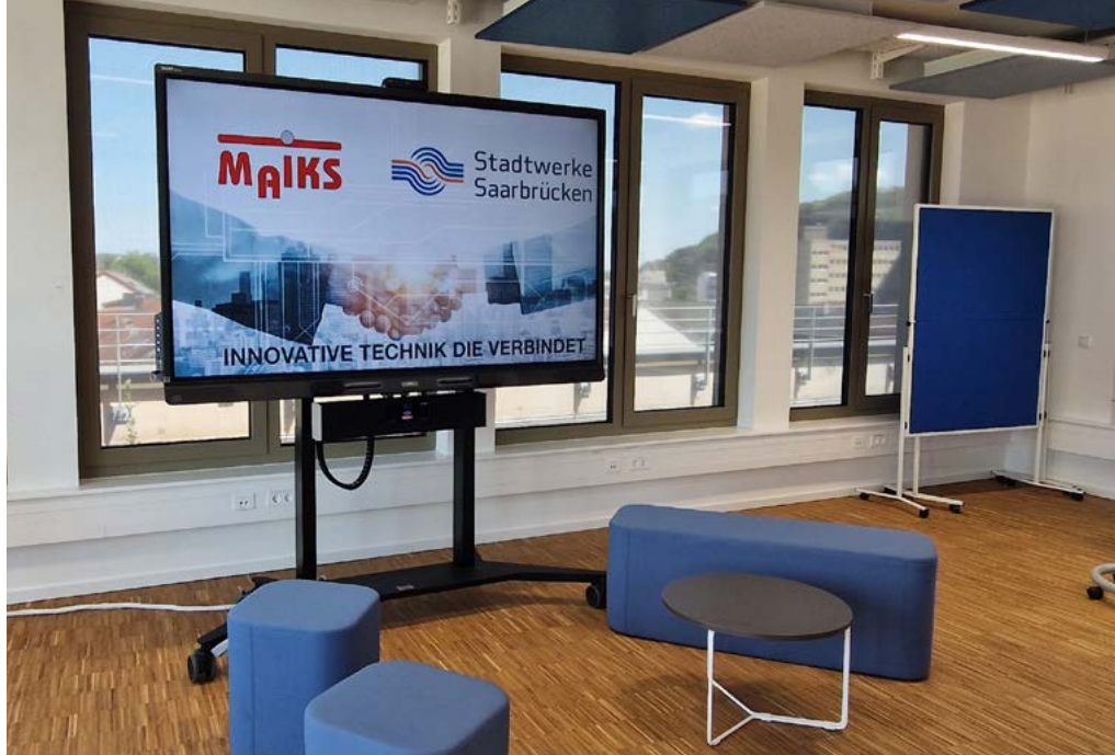
The Cynap Videobar combines award-winning Cynap wireless screen sharing technology together with a web conferencing camera, built-in speakers, and microphone, to provide a single, all-in-one, multi-functional AV system.