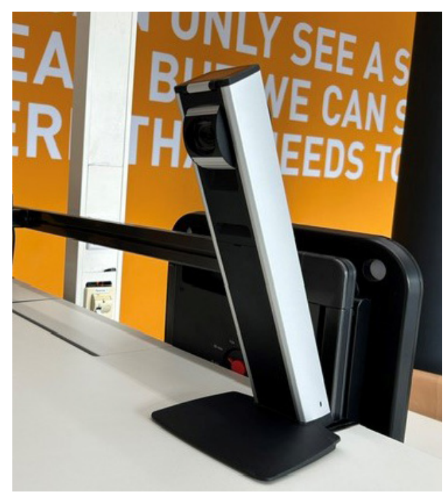
The WolfVision VZ-2.UHD document camera facilitates the onscreen display of physical materials up to A3 size.

Feedback from faculty has been overwhelmingly positive, with particular praise for the system's ease of use, and its reliability. The university's forward-thinking proach to AV technology, exemplified by its partnership with WolfVision, has not only enhanced the educational experience for its current students but has also set a new standard for academic institutions seeking to embrace the future of teaching and learning.