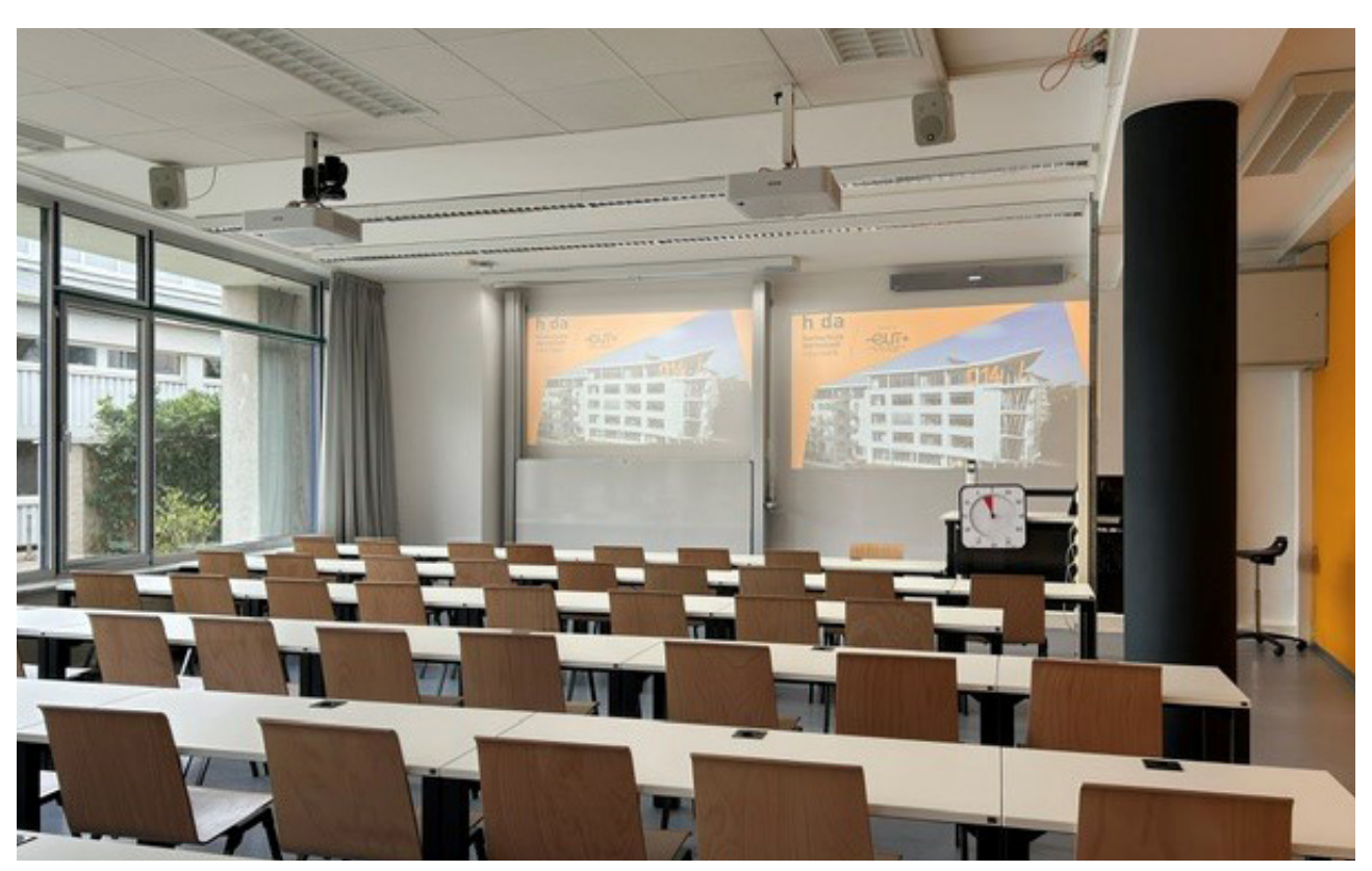
When web conferencing, the twin display screens enable remote participants to be shown on the left-hand display screen, and lesson content materials to be displayed on the right-hand screen.

gestures. The innovative workflow allows educators to prepare content layouts in advance or adjust them on-the-fly during lectures, enhancing the dynamic delivery of multi-source, multimedia educational materials. By facilitating the seamless integration of multiple content sources onto dual screens, vSolution