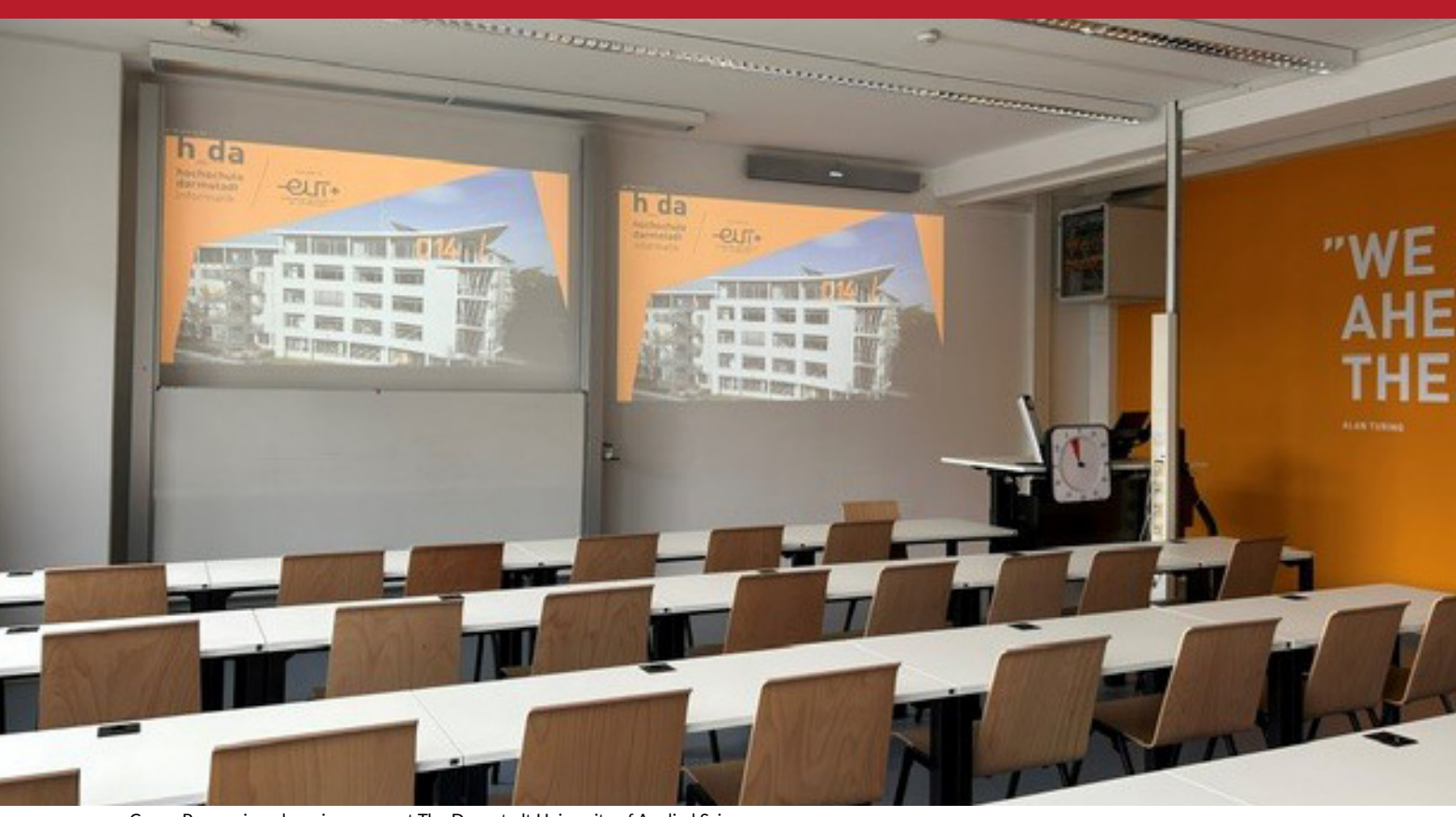
Cynap Pro-equipped seminar room at The Darmstadt University of Applied Sciences.

he Darmstadt University of Applied Sciences (h da), nestled in the heart of Darmstadt, Germany, epitomizes the blend of tradition and innovation. Established in 1971, h da has grown to become one of Germany's foremost universities of applied sciences, catering to a vibrant community of over 17,000 students.