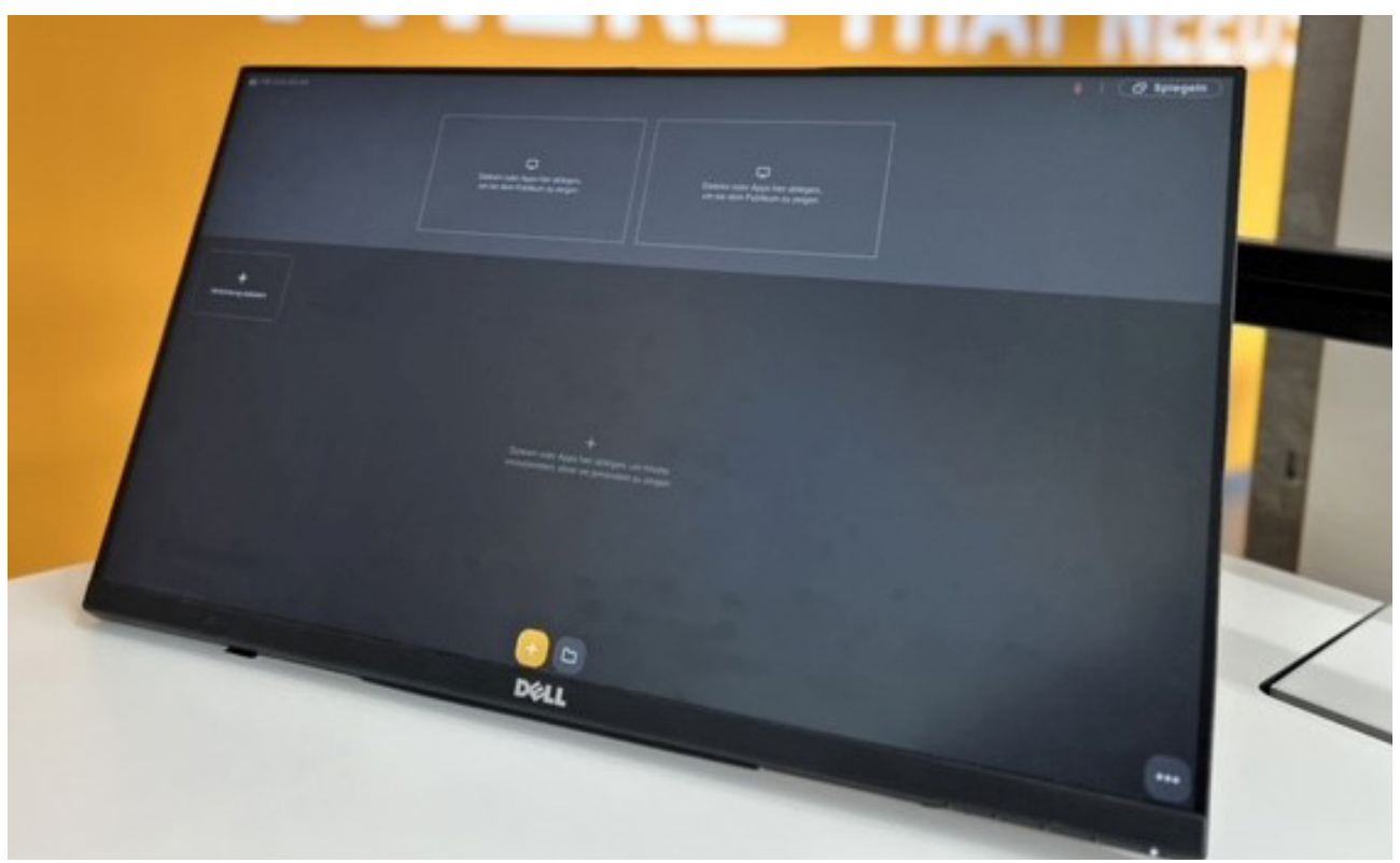
A preview monitor on the lectern enables advance preparation of lesson content which can be dragged and dropped easily onto either the right-hand or left-hand display screen as required.

As a strong advocate of hybrid learning, h_da utilizes the cross-platform web conferencing feature of Cynap Pro together with Big Blue Button, the open-source web RTC-based web confe-