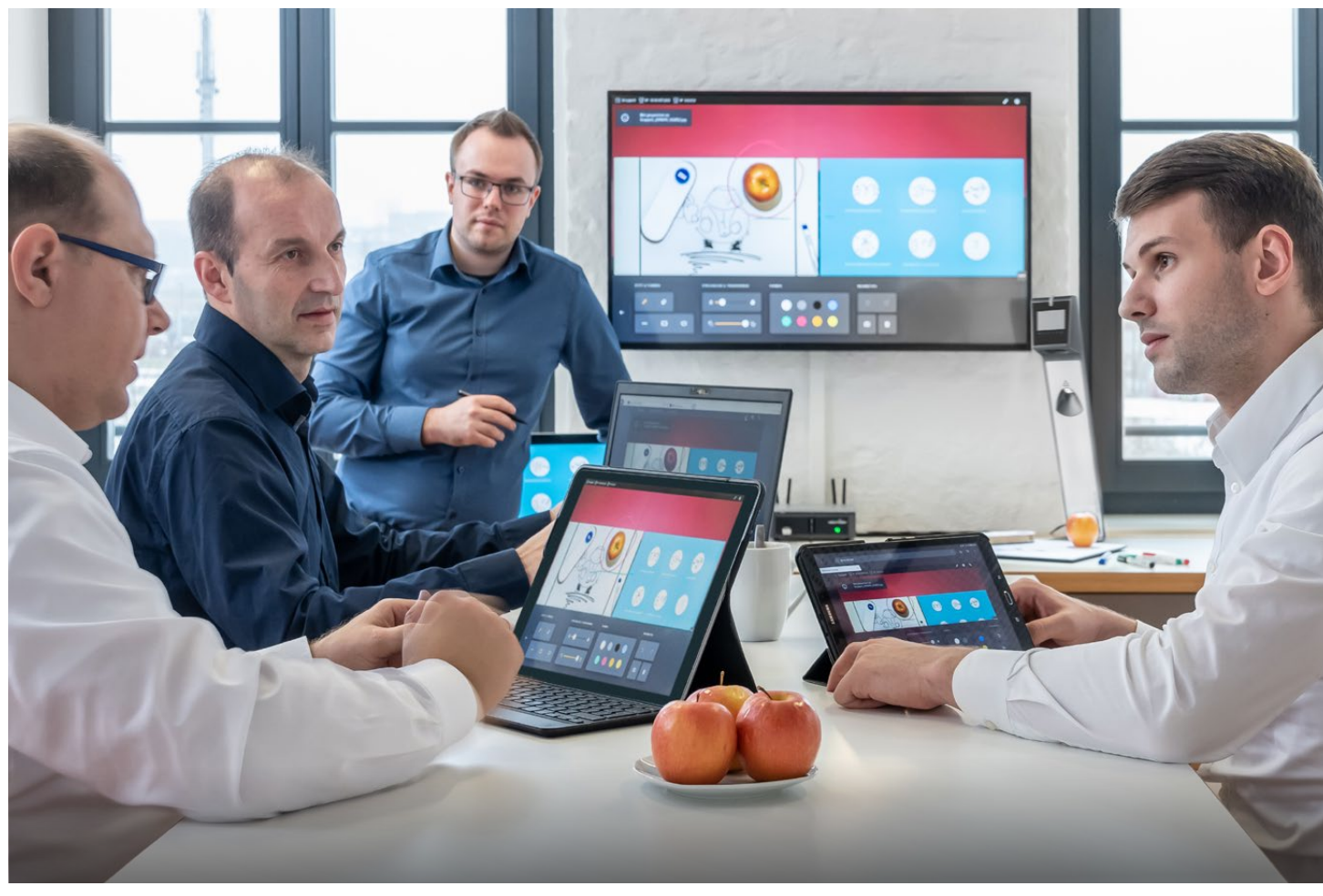
Printed in Germany, April 2023

Please contact a WolfVision representative for more information, and to learn about the multi-functional capabilities, flexibility, and usability of our unique wireless presentation, web conferencing, and collaboration solutions for inroom, virtual and hybrid meeting room environments.