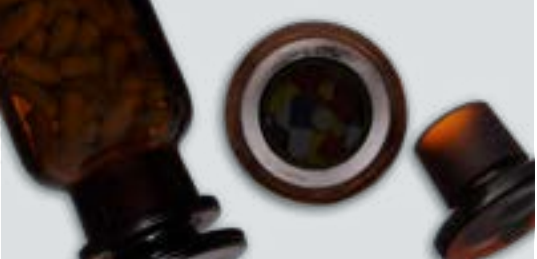
Not illuminated on the inside