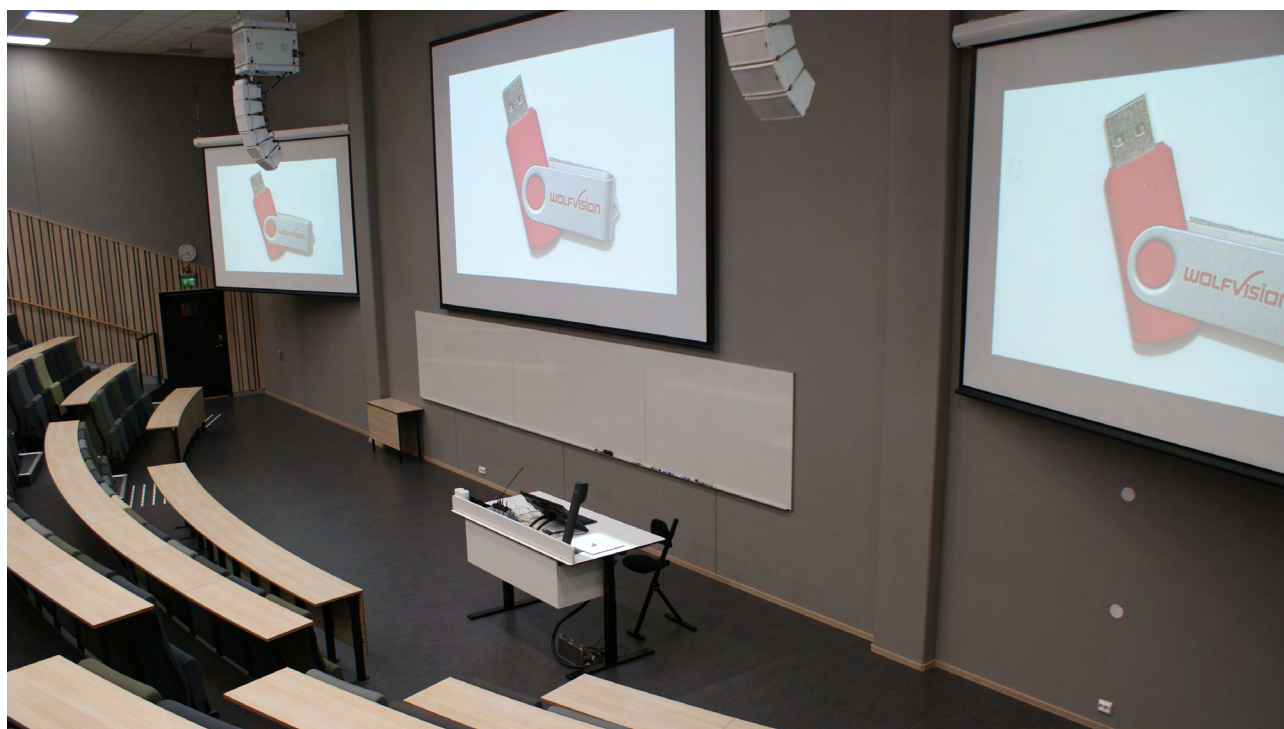
Content materials of all types, but especially handwriting, are picked up by the Visualizer and displayed on-screen for easy viewing by the entire class.