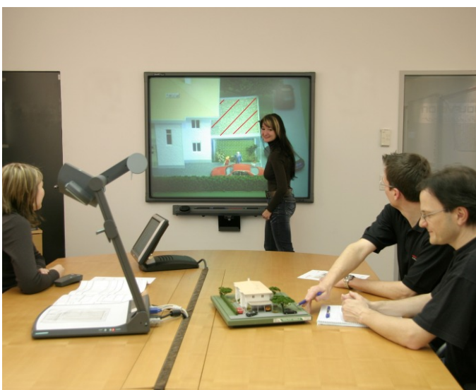
Zooming in on fine details

Due to its ease of use and versatility, the Visualizer is now being used for various applications. Apart from the originally planned internal training sessions and meetings, the VZ-9plus has become an integral tool during meetings with architects, product presentations and R&D meetings, to name but a few.